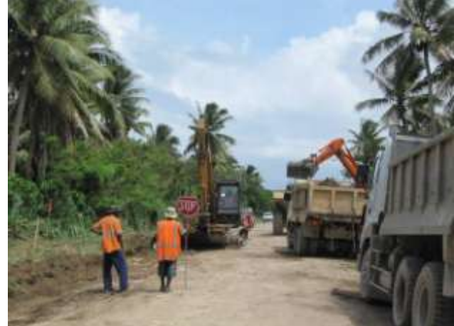
Efate: Clearing underway at Nangus - just South of Eton Village.