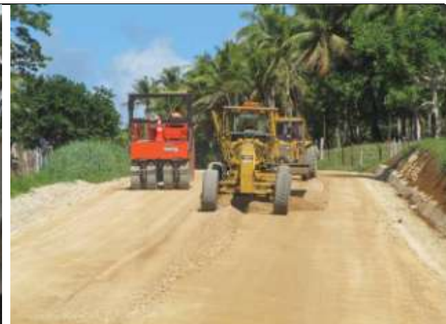
Efate - final trimming and shaping of the pavement in preparation for sealing at the 50 km mark near Ekipe Village.